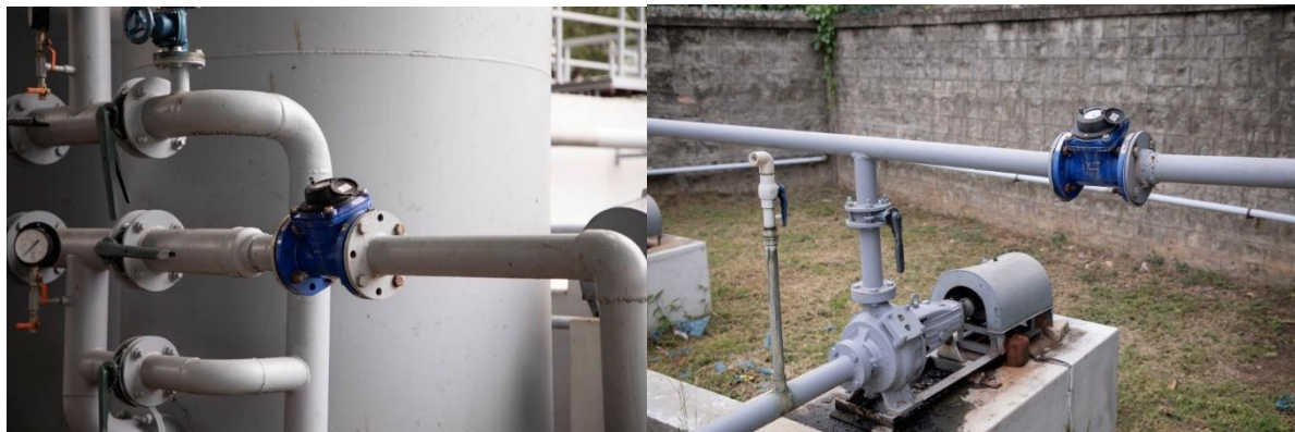
Flow meters at the filter unit of Treatment plant to measure the treated water used for gardening and irrigation

The flow meters have been placed at the storage tank of treated water and the measurement is done before being used for gardening and irrigation.