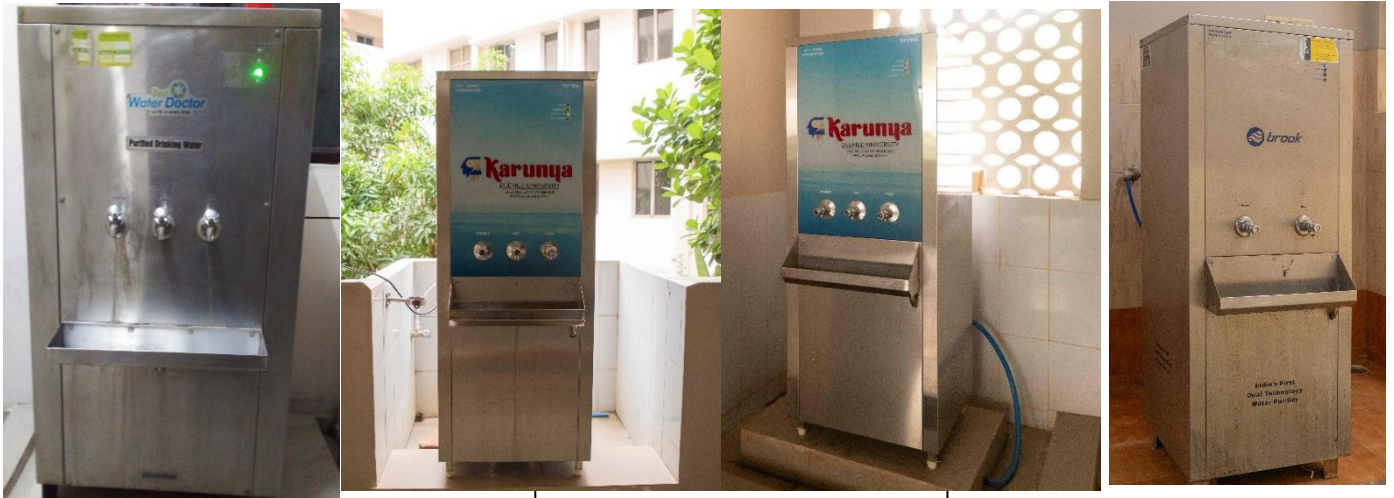
Water Purifiers – For Drinking