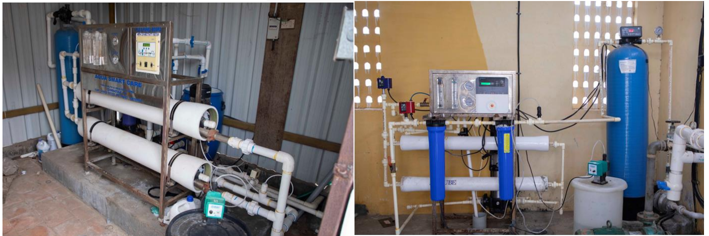
R.O Treated Water – For Drinking and in the Kitchen