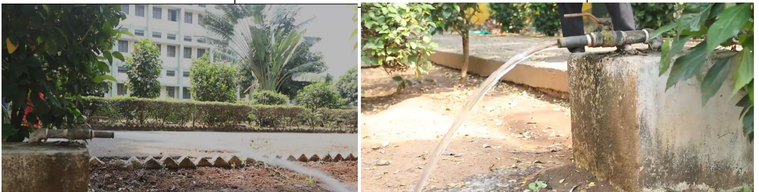
Reuse of Treated / Recycled water from Greywater Treatment Plant for Irrigation and Gardening